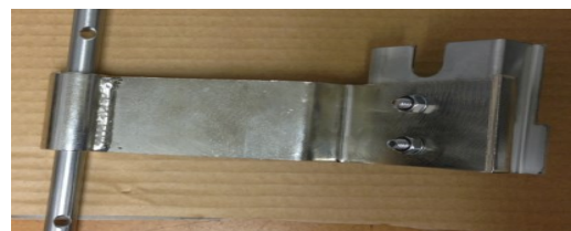
right hand photo

Step 6: Place the motor body arm on the davit rod with the cut out for the rotisserie rod to the top.