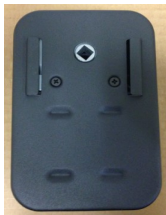
Rotisserie Motor - rated to 4kg