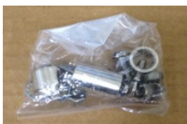
Screws for fastening