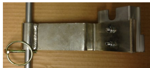
right hand photo

Step 7: Re-insert the lynch pin at the desired height. Place davit rod into the firebox