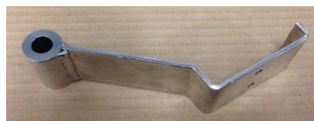
Rotisserie motor body arm