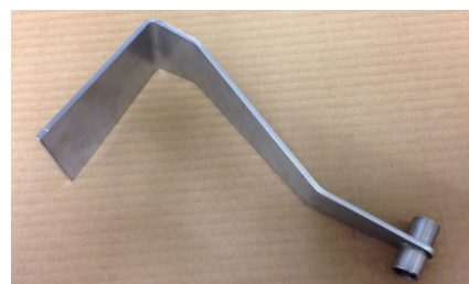
Rotisserie rod holder