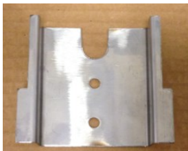
Rotisserie motor bracket