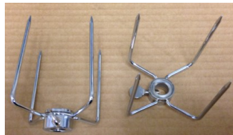
Rotisserie 4 prong skewers